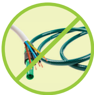
NO Garden Hoses, Cords, Ropes, or Wires