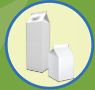
Clean Milk and Juice Cartons