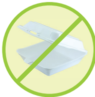
NO Polystyrene Foam