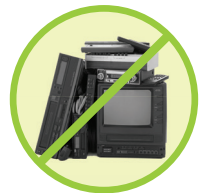
NO Electronics (recycle at a Community Collection Center)