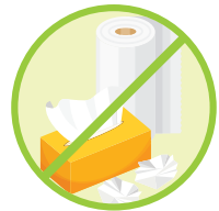
NO Soiled Paper Items