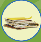
Dry Paper, Newspaper, and Junk Mail