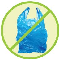
NO Plastic Bags or Film