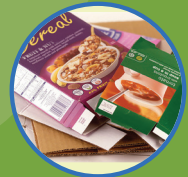
Dry Paperboard Boxes