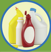
Clean Plastic Bottles and Containers (caps on)