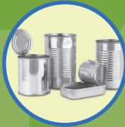
Clean Steel and Tin Metal Containers