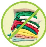
NO Clothing, Shoes, or Textiles