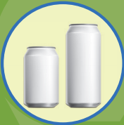
Clean Aluminum Cans