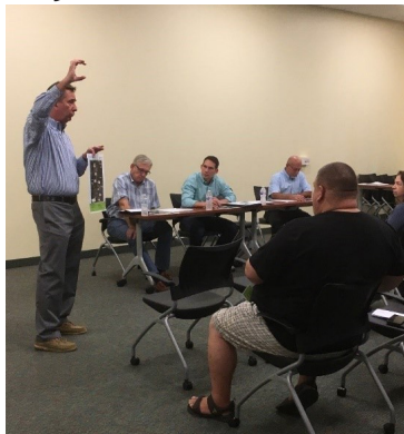
On December 7, staff met with the Fawn Ridge Homeowners Association regarding the River Oaks wastewater and reclaimed water project.

The Office of Neighborhood Relations (ONR) is an important partner for County departments that are involved with completing or permitting projects in local communities. Design, construction, and infrastructure projects, as well as operational changes, affect residents or businesses. ONR works with the department's project manager and the Communications & Digital Media team to inform and engage stakeholders, who provide a wealth of important information that helps to optimize projects and broaden community involvement. Recent projects that employed this approach